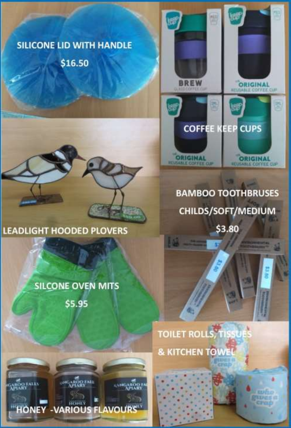
SILICONE LID WITH HANDLE $16.50